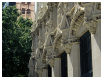
Main Street Architecture

Columbia’s Main Street boasts architectural styles spanning three centuries that speak to the tastes, interests, and aspirations of persons living and working in South Carolina’s second state capital. The architectural evolution of this central commercial corridor reads like an epic novel. War, politics, and the ebb and flow of public and private money have all left their mark on each block. While fire reduced the entirety of Main Street from