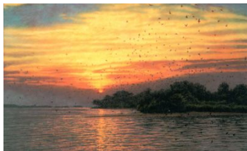
Purple Martins Landing

The Purple Martin Cruise is a phenomenon you have to see to believe. This 2 1/2 hour cruise takes you out to historic Bomb Island, where hundreds of thousands of birds (Purple Martins) circle and roost on the largest Purple Martin sanctuary in North America. Dur-